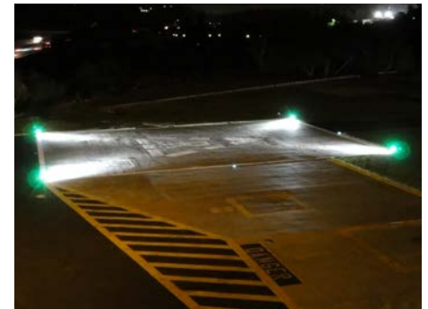
Surface floodlights provide uniform lighting without glare

the pilot and crew. The LED lamps cannot be seen, even when standing in the center of the pad (proper aiming of the floodlights is necessary).