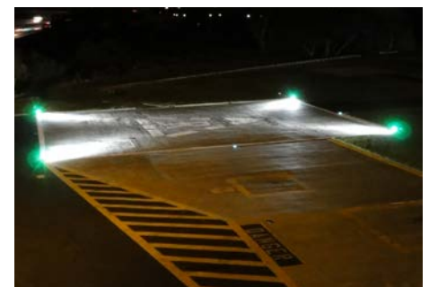
Surface floodlights provide uniform lighting without glare