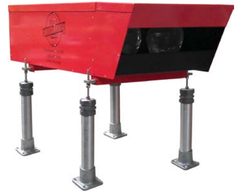
Four legs equipped with frangible floor flanges provide extra stability.